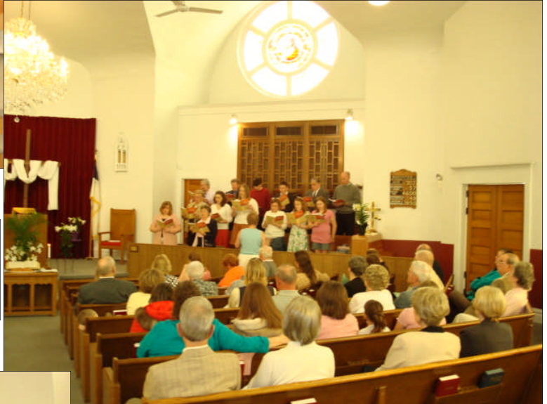
Wonderful music from a great choir