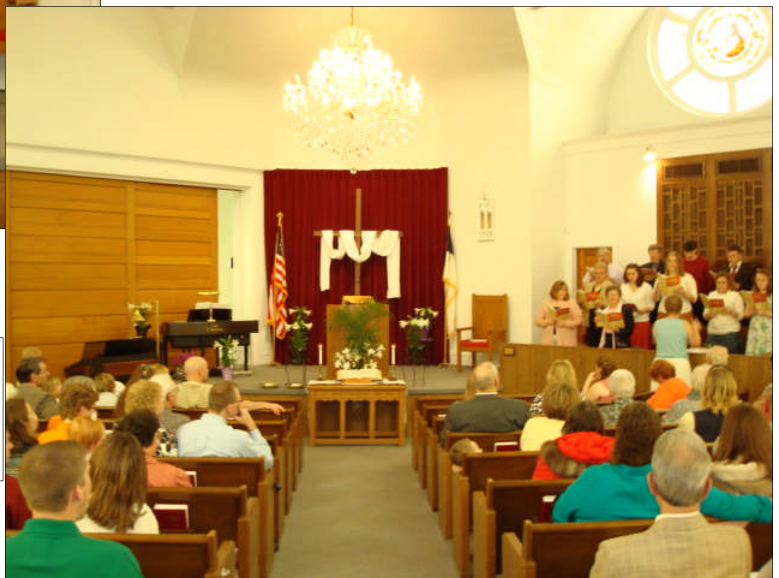
Friendly Congregation who loves God