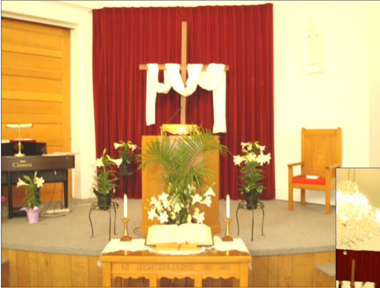
A beautiful church with beautiful windows